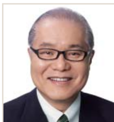
Hon Dr Keizo Takemi, MP, Japan

Hon Dr Keizo Takemi is a Liberal Democratic Party (LDP) member of the Japanese House of Councillors and serves as Chairman of the Investigation Committee on Governing Structure of the House of Councillors, and as Deputy Chairman of the LDP's General Council. He served as State Secretary for Foreign Affairs in 1998–1999, and was Senior Vice Minister of Health, Labour and Welfare in 2006–2007.