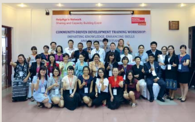
“Imparting knowledge and enhancing skills on community development”

Deadline for application: 13 September 2018