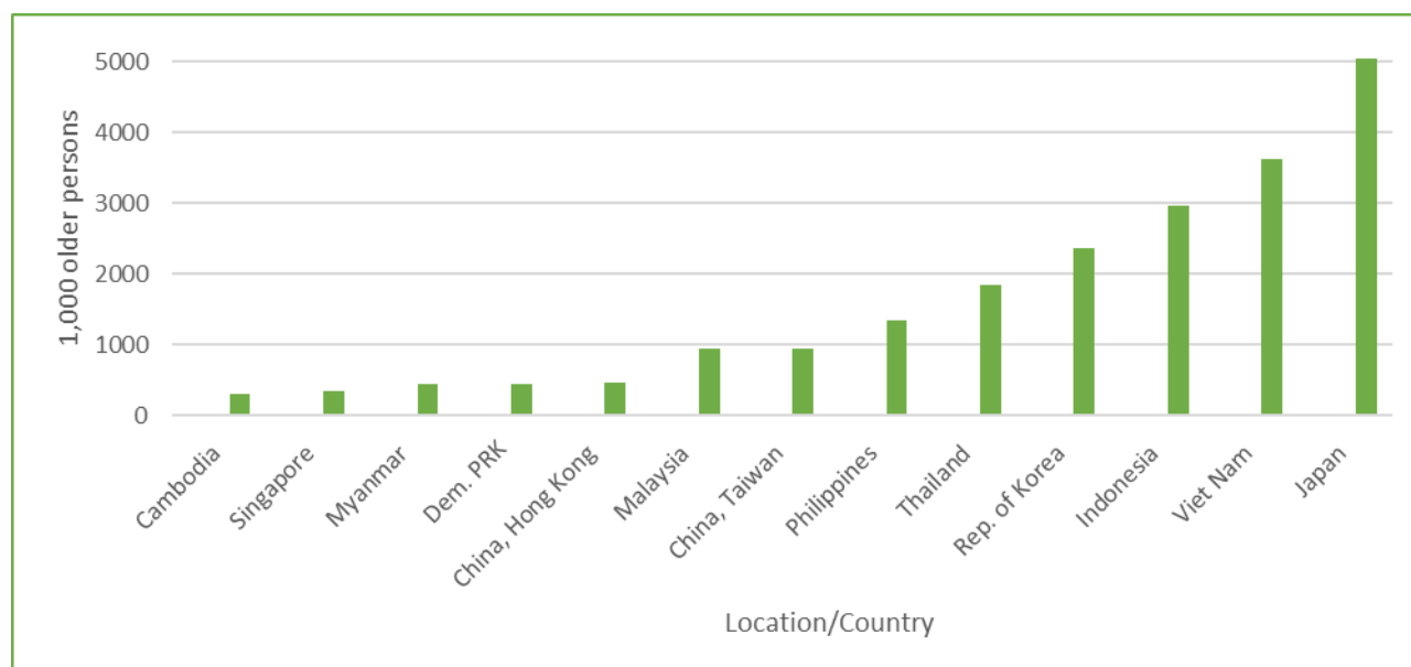
Figure 2: Estimates of Care Need in Selected East and Southeast Asia locations (1,000 older persons) for 2100

Source: Hayashi, R. (2018). Demand and Supply of Long Term Care for Older Persons in Asia . Indonesia: Economic Research Institute for ASEAN and East Asia (ERIA). * Care need is defined as the need for intensive assistance which should be that supported by social welfare systems.